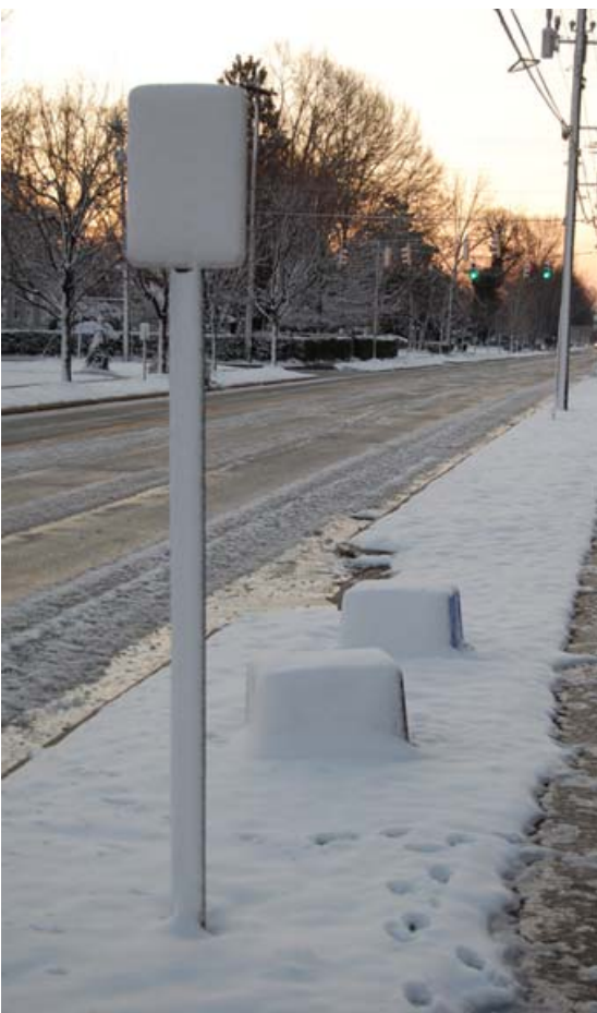
Our meeting was cancelled last week due to snowfall and closed schools in Alamance county.