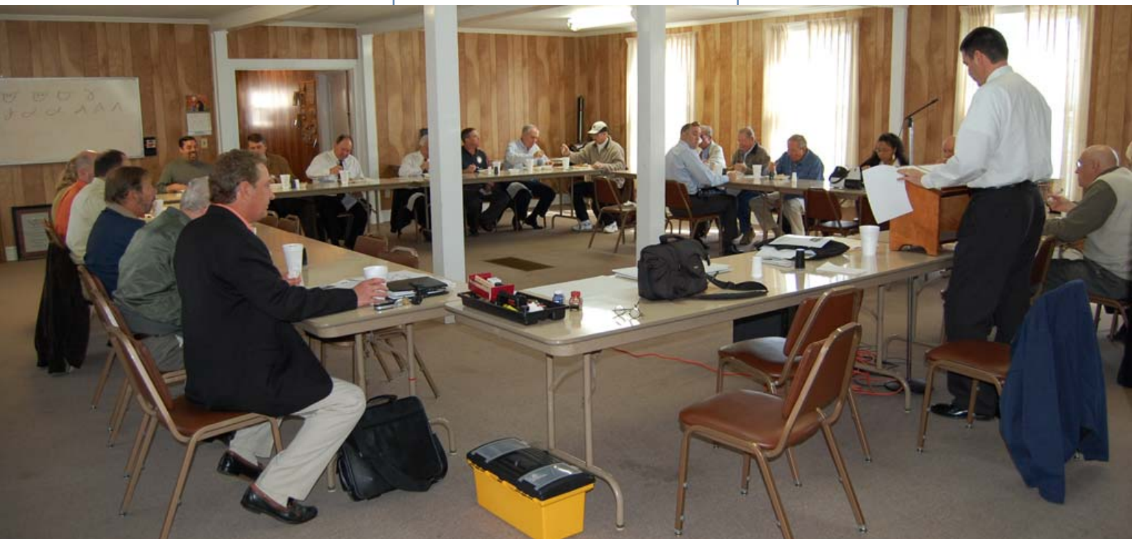
The Graham Rotary Club meets in their new digs.