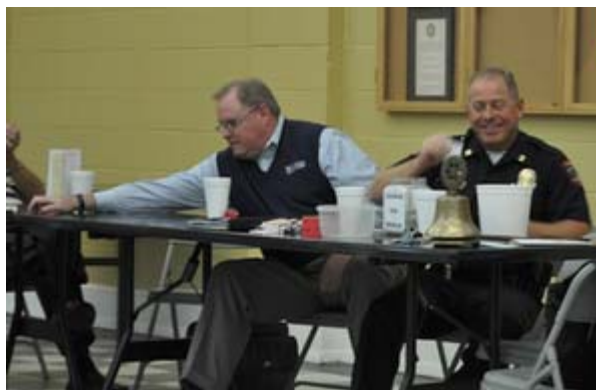
Ah, the joy of letting the pot grow...