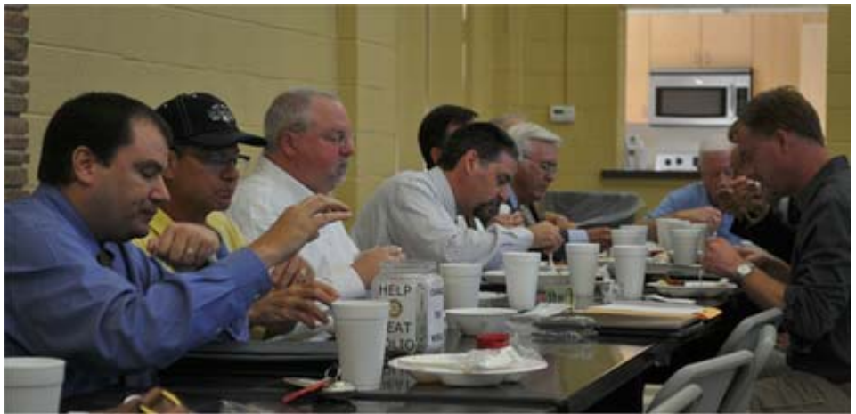
Good lunch today...