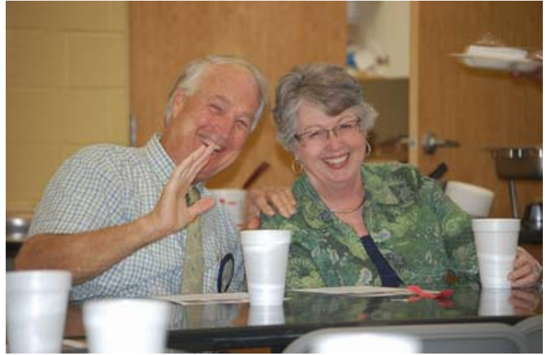
Ah, romance is in the air...