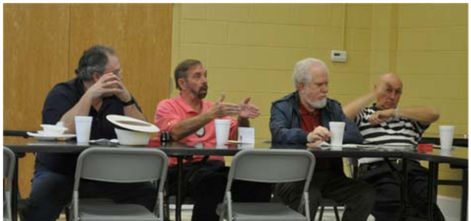
Tough questions from the audience...